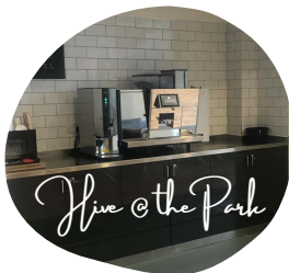
Live @ the Park